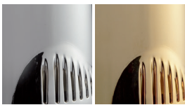
CHROME SILVER CHROME GOLD