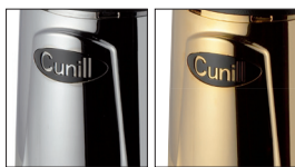
CHROME SILVER CHROME GOLD