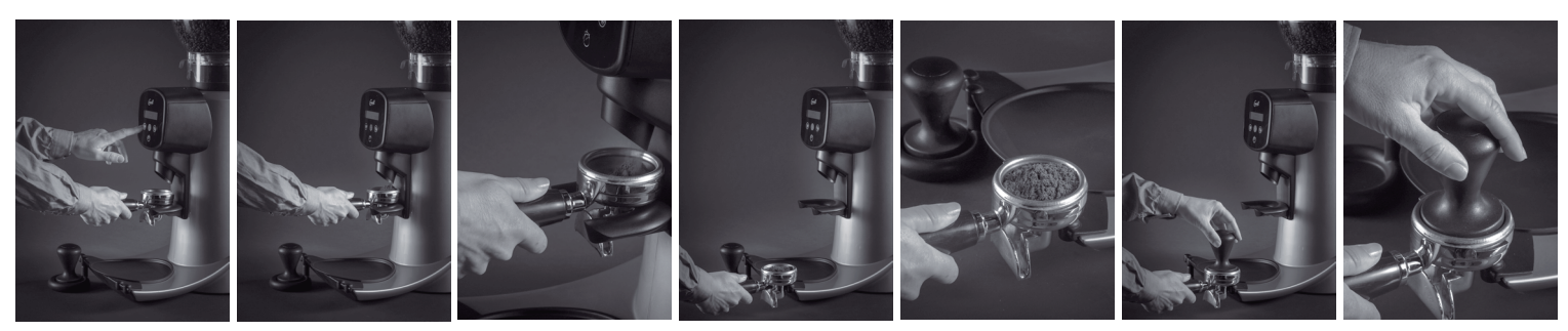
Dose selection by placing the coffee holder on the wedge for filling the selected ground coffee.

15" to 20" (very coarse grinding) WRONG COFFEE 20" to 25" (fine grinding) RIGHT COFFEE 25" to 30" (very fine grinding) WRONG COFFEE