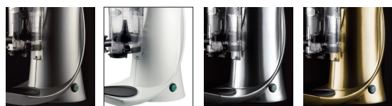
GREY METALLIC SILVER SNOW WHITE CHROME SILVER CHROME GOLD.