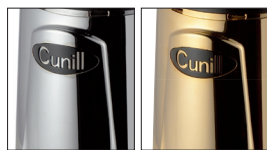
CHROME SILVER CHROME GOLD