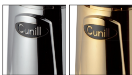
CHROME SILVER CHROME GOLD